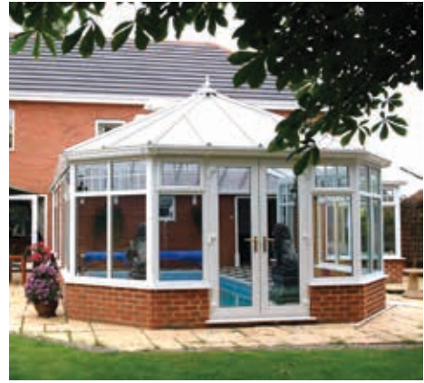
White Bespoke pool room with low wall, French doors and top openers with internal fret