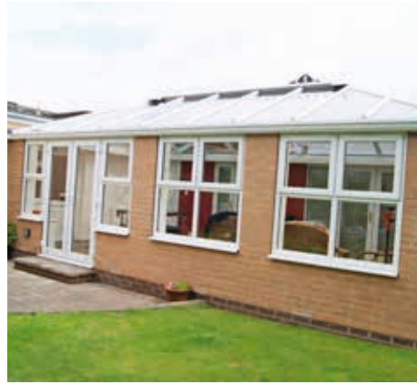
White Bespoke with French doors, top openers and brick columns