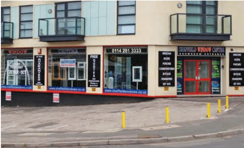
Our conservatory showroom, Rockingham Street

In most properties, a modern, new conservatory is the most cost effective way to achieve extra space. Whether you want a garden room, a playroom, a home office or even additional kitchen space, a conservatory gives you the space and the freedom to realise your plans.