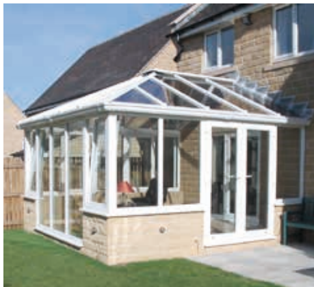
White Edwardian with French doors, no transom and panoramic frames at the front

Here at Sheffield Window Centre, all of our conservatories are made-to-measure and we manufacture everything at our Sheffield factory. This means that we are able to produce completely unique and bespoke designs. With so many shapes, sizes, colours and finishes to choose from, the possibilities are endless! Over the next few pages are just a few examples of conservatories we have manufactured in the past, to give you some ideas and inspiration.