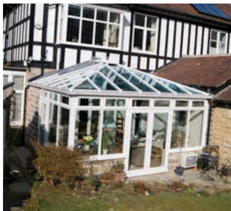
White Edwardian with tall frames, transom, French doors and top openers