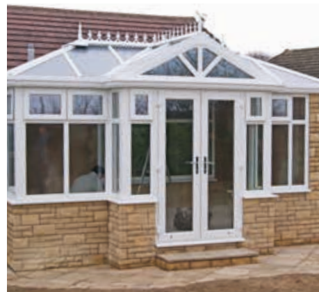
White Bespoke Gable Fronted with French doors and top openers