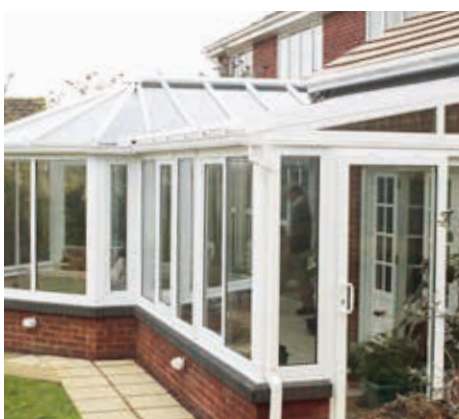
White P-Shaped Victorian style with low wall, inline sliding patio, and large push out openers