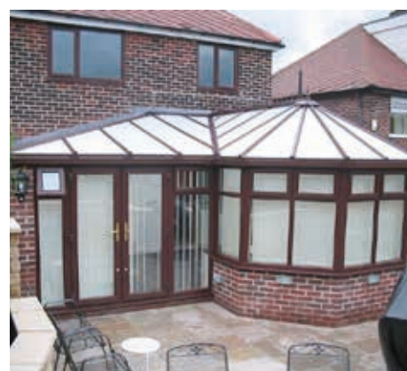
Rosewood Bespoke P-Shaped with French doors and top openers