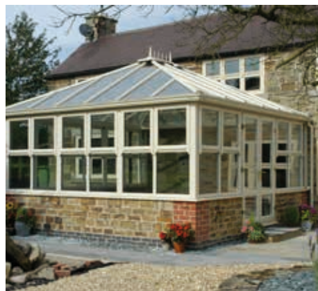
Cream Edwardian with French doors and mock sash top openers