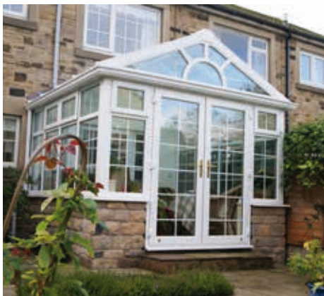
White Gable Fronted with sunburst, French doors, top openers and internal Georgian fretwork