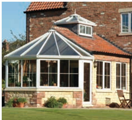
White 3 facet Victorian with internal Georgian fret and single door