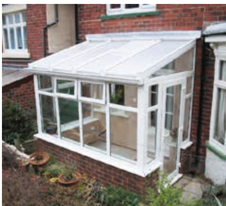
White Lean-To with single door and top openers