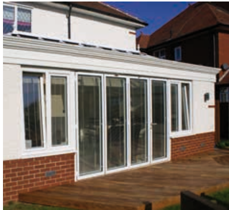
White Orangery with 4 panel bi folding doors and tilt and turn windows