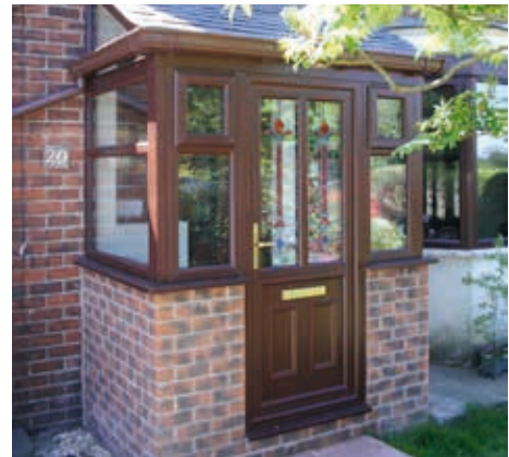
Lean To style Porch with tiled roof and Rosewood uPVC door and windows