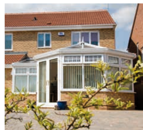
White P-Shaped with French doors and top openers with internal Georgian fret design