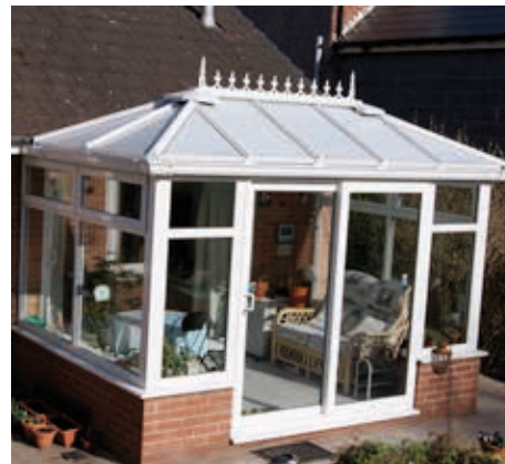
White Edwardian with small wall, inline sliding patio doors and openers in the side frames