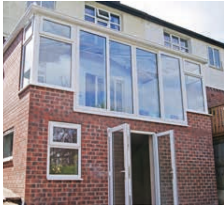
Two storey conservatory with panoramic panels, French doors and windows with top openers