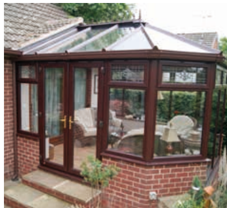
Rosewood Victorian with French doors and top openers with lead and bevel glass design