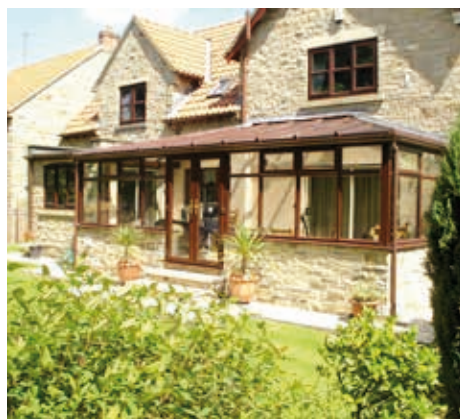
Large Rosewood hipped Lean-To with small wall, French doors and openers in front frame