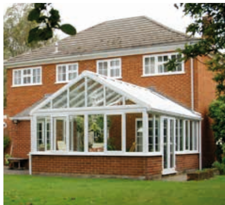
White Gable Fronted with French doors and large push out windows