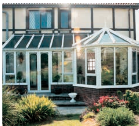
White P-Shaped Victorian style with French doors and large push out openers