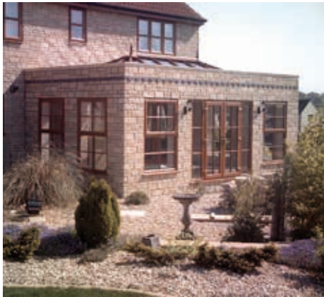
Rosewood Orangery with French doors, external fret and top openers