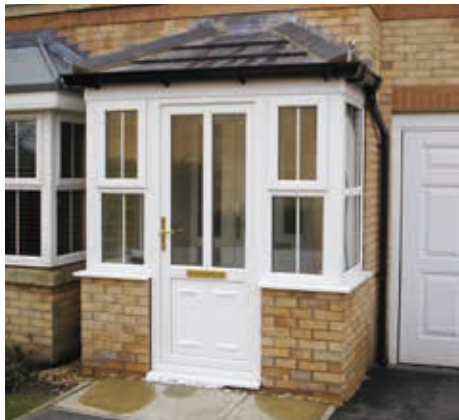
Porch with hipped tiled roof and white uPVC door and windows with internal fret