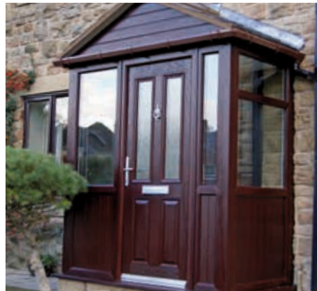
Gable Fronted Porch with tiled roof and a Rosewood composite door and windows