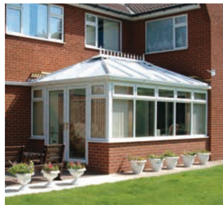
White Edwardian with small wall, French doors and top openers