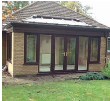
Rosewood Orangery with French doors and panoramic sidelights and large push out windows