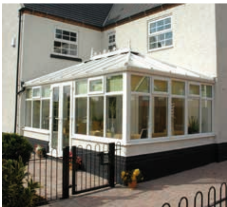
White Edwardian with small wall, French doors and top openers