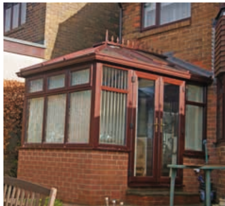
Rosewood Edwardian with small wall, French doors and top openers in front frame