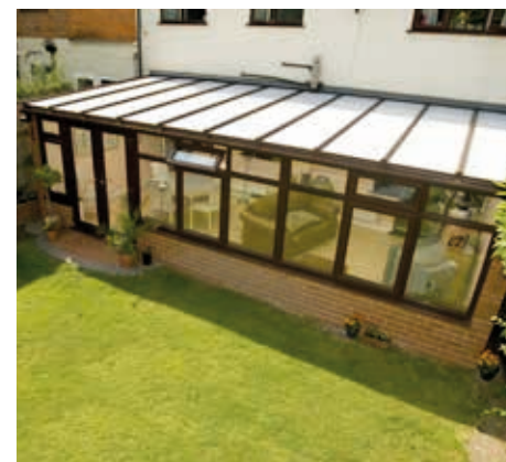
Rosewood Lean-To with off set French doors and top openers