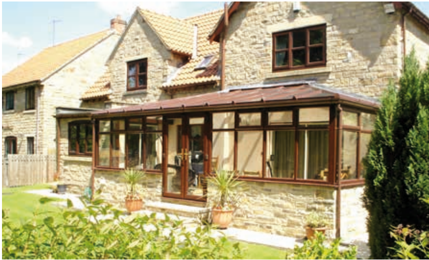
Rosewood hipped Lean-To conservatory

frames, and you can even add glass detailing such as Georgian bars or bevelled glass to completely personalise your new room space. During construction we always take time to provide the best brick match available and take care of all finishing touches, including giving you a choice of colour finishes for handles, plug sockets and wall lighting to suit your conservatory design.