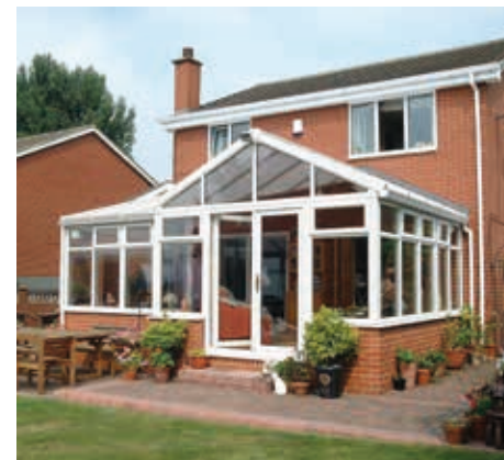
White Bespoke Gable Fronted with French doors and top openers