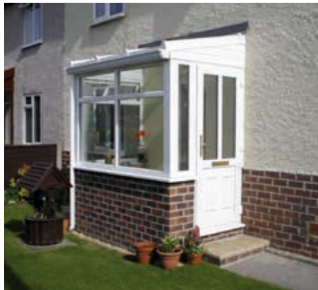
Lean-To style Porch with white windows and uPVC door