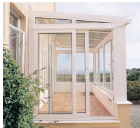
White Lean-To with low wall, inline sliding patio and large push out openers