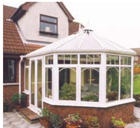
White Victorian with French doors and internal Georgian arched fretwork design