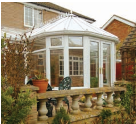
White 5 facet Victorian with French doors and top openers with bevelled glass design