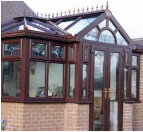
Rosewood Bespoke design with French doors, top openers, sunburst and bevelled glass design