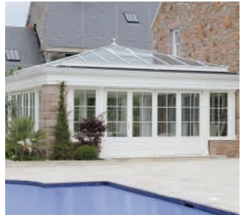
White Orangery with French doors and internal fret work