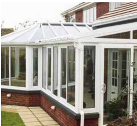
White P-Shaped Victorian style with low wall, inline sliding patio, and large push out openers