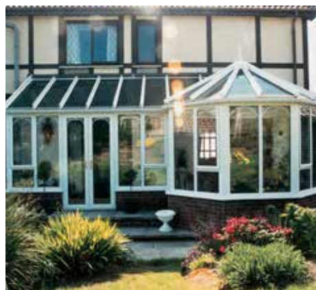
White P-Shaped Victorian style with French doors and large push out openers