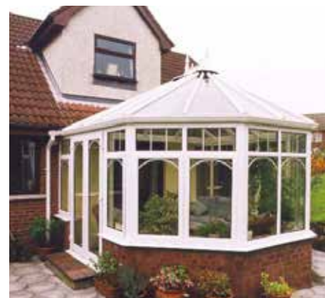
White Victorian with French doors and internal Georgian arched fretwork design