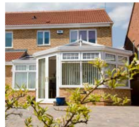
White P-Shaped with French doors and top openers with internal Georgian fret design