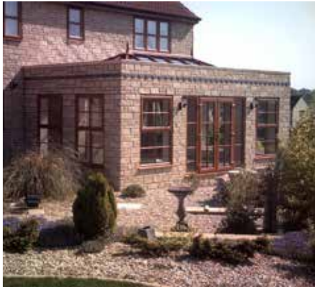
Rosewood Orangery with French doors, external fret and top openers