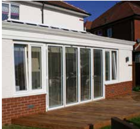
White Orangery with 4 panel bi folding doors and tilt and turn windows