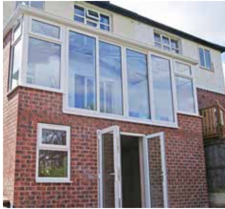
Two storey conservatory with panoramic panels, French doors and windows with top openers