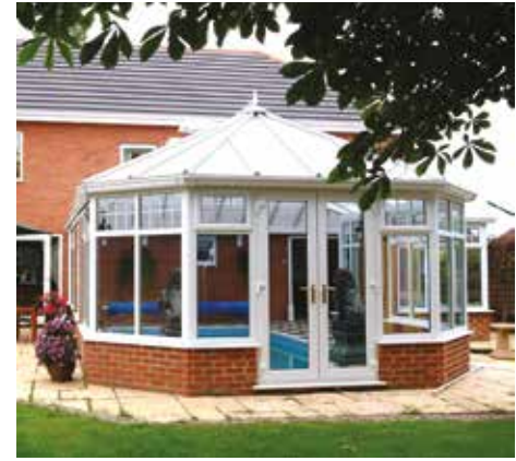
White Bespoke pool room with low wall, French doors and top openers with internal fret