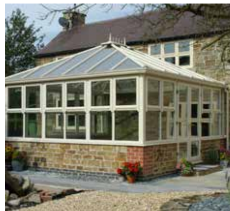
Cream Edwardian with French doors and mock sash top openers