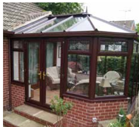
Rosewood Victorian with French doors and top openers with lead and bevel glass design