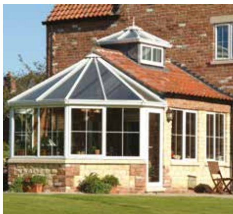
White 3 facet Victorian with internal Georgian fret and single door