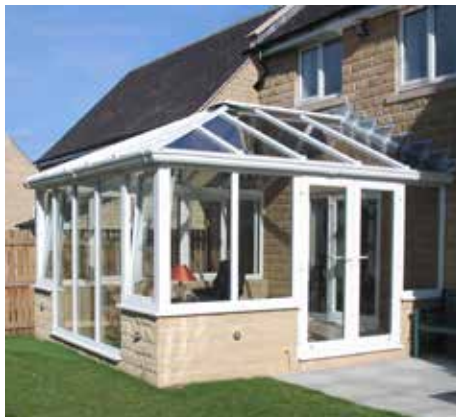
White Edwardian with French doors, no transom and panoramic frames at the front

H ere at Sheffield Window Centre, all of our conservatories are made-to-measure. This means that we are able to produce completely unique and bespoke designs. With so many shapes, sizes, colours and finishes to choose from, the possibilities are endless! Over the next few pages are just a few examples of conservatories we have manufactured in the past, to give you some ideas and inspiration for your own home.