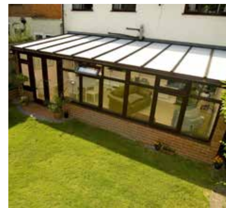
Rosewood Lean-To with off set French doors and top openers