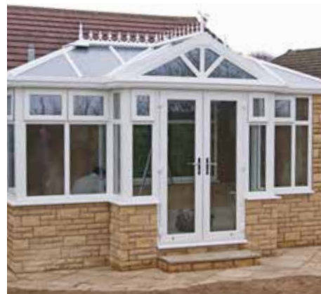
White Bespoke Gable Fronted with French doors and top openers