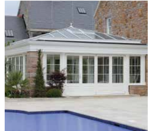
White Orangery with French doors and internal fret work