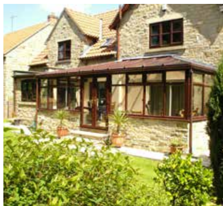
Large Rosewood hipped Lean-To with small wall, French doors and openers in front frame