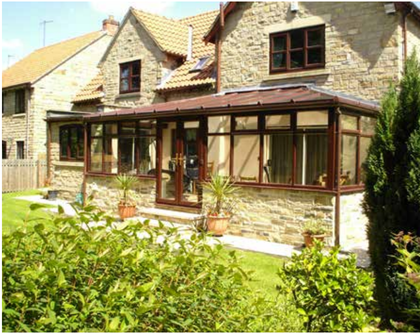
Rosewood hipped Lean-To conservatory

conditioning, flooring (including under-floor heating), paving and steps if required, giving you a complete service for peace of mind. Our Conservatory Installations Manager will manage your project every step of the way and will keep in close contact so that you are kept fully informed of how your job is progressing.