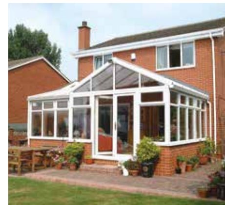
White Bespoke Gable Fronted with French doors and top openers