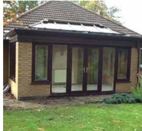
Rosewood Orangery with French doors and panoramic sidelights and large push out windows