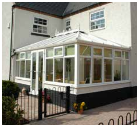
White Edwardian with small wall, French doors and top openers