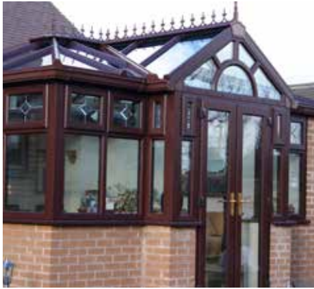
Rosewood Bespoke design with French doors, top openers, sunburst and bevelled glass design