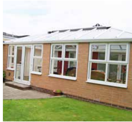
White Bespoke with French doors, top openers and brick columns