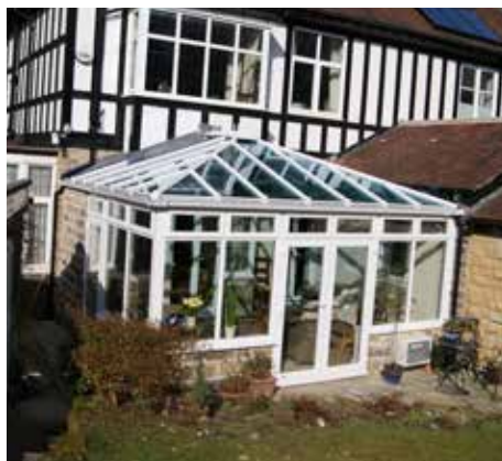
White Edwardian with tall frames, transom, French doors and top openers