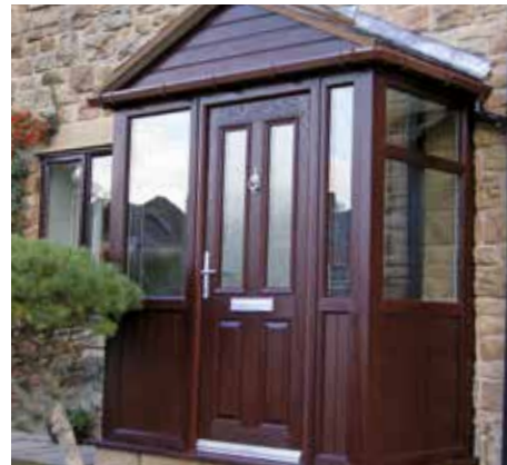
Gable Fronted Porch with tiled roof and a Rosewood composite door and windows