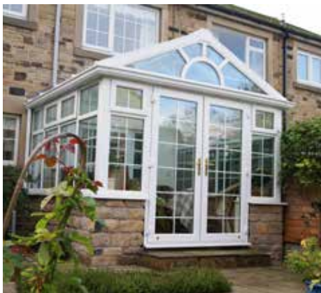
White Gable Fronted with sunburst, French doors, top openers and internal Georgian fretwork