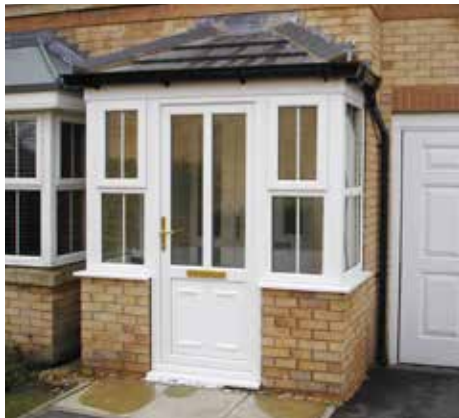
Porch with hipped tiled roof and white uPVC door and windows with internal fret