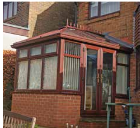
Rosewood Edwardian with small wall, French doors and top openers in front frame