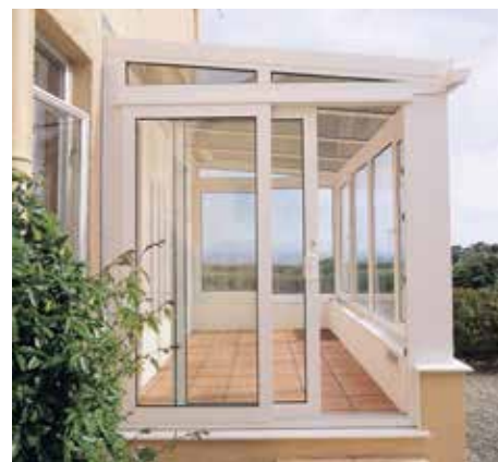
White Lean-To with low wall, inline sliding patio and large push out openers