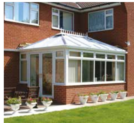
White Edwardian with small wall, French doors and top openers