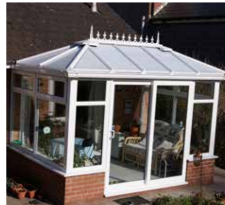
White Edwardian with small wall, inline sliding patio doors and openers in the side frames