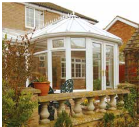
White 5 facet Victorian with French doors and top openers with bevelled glass design