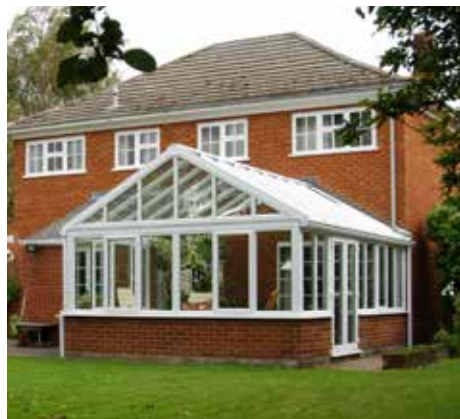
White Gable Fronted with French doors and large push out windows