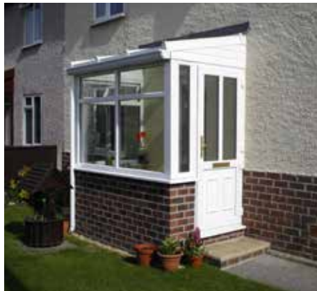
Lean-To style Porch with white windows and uPVC door