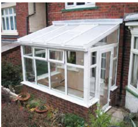
White Lean-To with single door and top openers