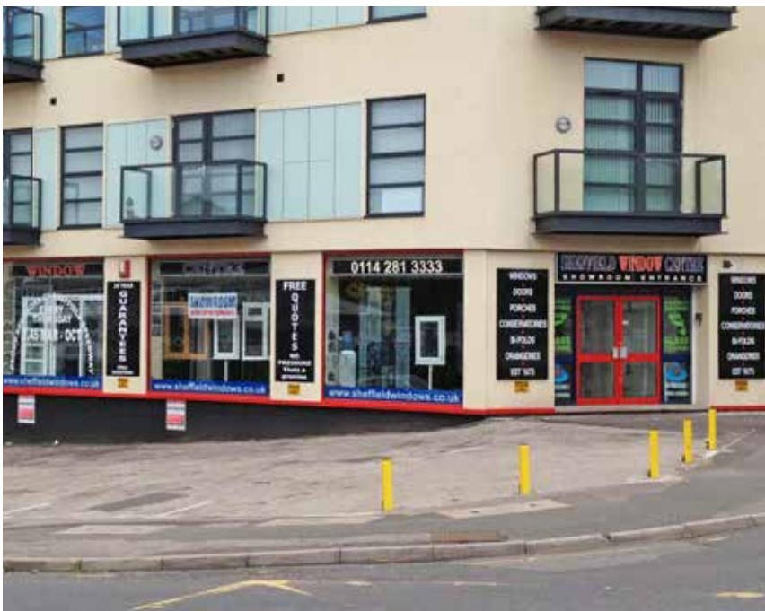
Our conservatory showroom, Rockingham Street

In most properties, a modern, new conservatory is the most cost effective way to achieve extra space. Whether you want a garden room, a playroom, a home office or even additional kitchen space, a conservatory gives you the space and the freedom to realise your plans.