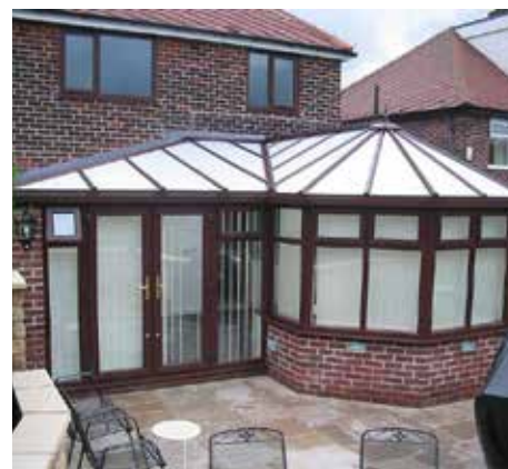
Rosewood Bespoke P-Shaped with French doors and top openers