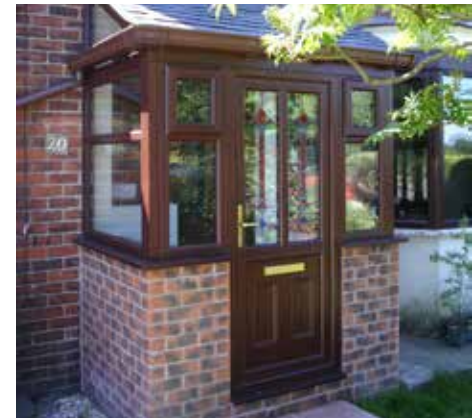
Lean To style Porch with tiled roof and Rosewood uPVC door and windows